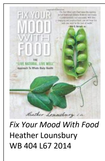
Fix Your Mood With Food Heather Lounsbury WB 404 L67 2014