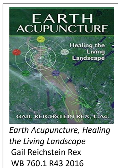
Earth Acupuncture, Healing the Living Landscape Gail Reichstein Rex WB 760.1 R43 2016